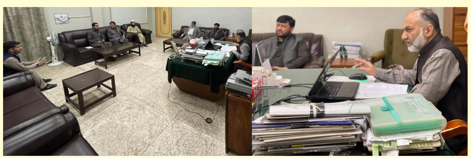
Meeting regarding "Development of Local Variants based infectious bronchitis virus (IBV) and Newcastle Disease Virus (NDV) vaccine for the control of major threat to local poultry Industry" at Directorate General (Research) Livestock & Dairy Development, Khyber Pakhtunkhwa.