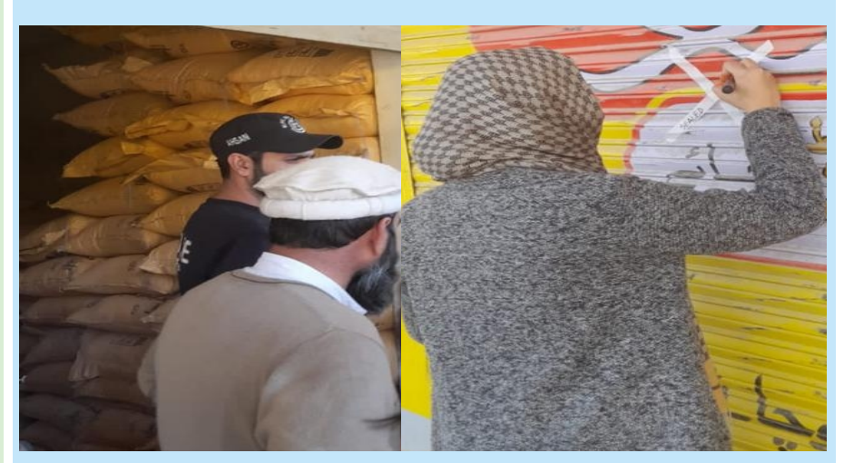
Assistant Commissioner Tehsil Baffa District Manshera sealed Fertilizer dealers shop due to non-maintenance of proper record of sale and purchase in coordination with incharge Agriculture officer circle Baffa Mansehra.