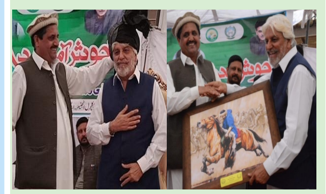
Honorable Minister for Agriculture LiveStock, Fisheries and Cooperative visited office of the District Director Agriculture Extension D.I.Khan.